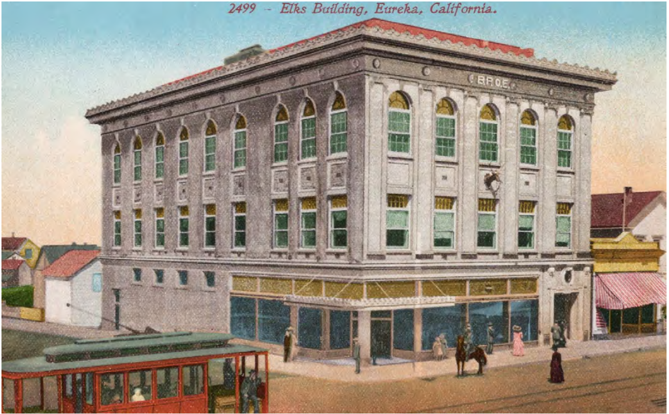
2499 - Elks Building, Eureka, California.