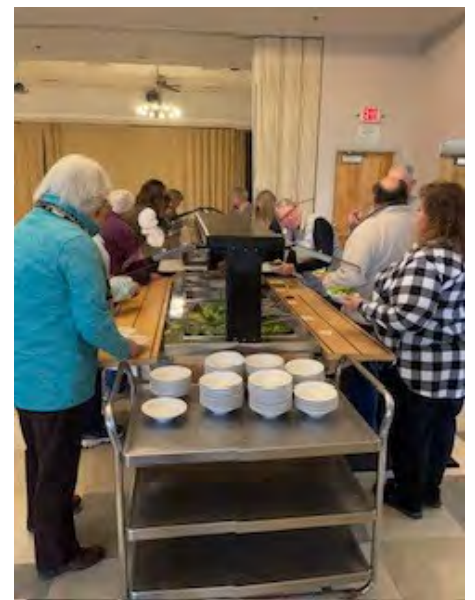
Using the new steam table for the event!