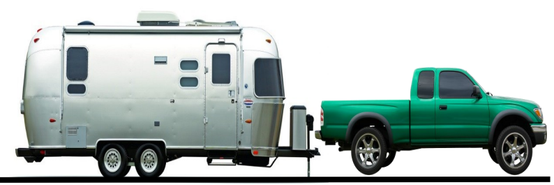
Redwood Roamers of Eureka California Elks

The Redwood Roamers RV Club has 54 families who enjoy sharing the outdoors together. The Roamers meet the first Wednesday of the month at the Lodge to spread fellowship and plan monthly outings. Each outing has a Trailblazer and a Greaser. These two have the responsibility of planning and making all of the arrangements for a successful adventure. Come join us for an adventure or a meeting.